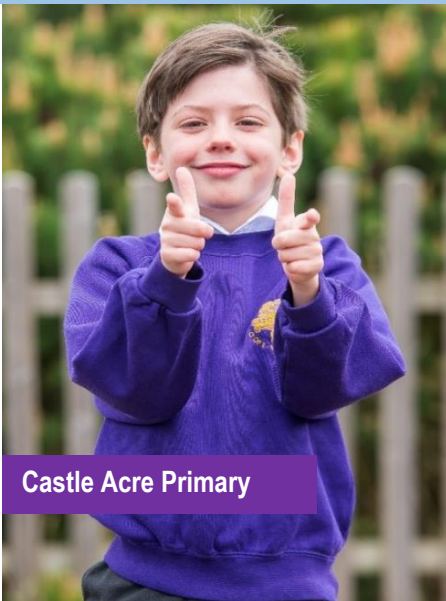
Castle Acre Primary