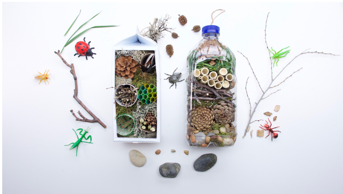
A Bug Hotel Idea