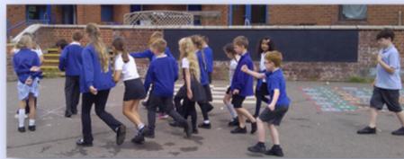
Learning directions on a compass

This week in Woodpeckers we have loved learning about compass directions in geography. We learnt how to use these to navigate on a map. We even got to practise using our directions outside on the playground and it was great fun. In English we have been writing our newspaper articles about the Spanish Armada. In maths we've enjoyed using bar charts to retrieve data and information.