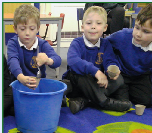
The children are planting sunflower seeds