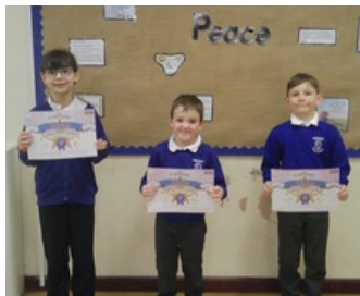
Well done to this week's Shining light winners