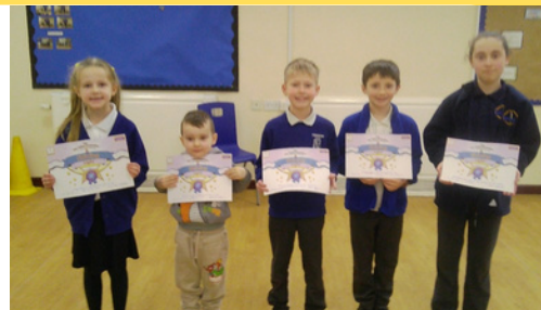
Well done to this week's Shining light winners

This week, it has been fantastic to witness the determination of a group of year 6 children. They identified the need for improving our play equipment at lunchtimes, so have met weekly to plan how they can raise money to purchase equipment. This Friday was the first of their hairdressing sessions. I was amazed by the skill demonstrated by the "hairdressers" and the calm and friendly atmosphere of the "salon". Next week Foxes are invited to attend the Salon £1 per child! please help us support them in their endeavour to raise money for the school.